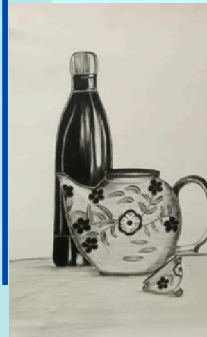
Anshika Haldar 12th B