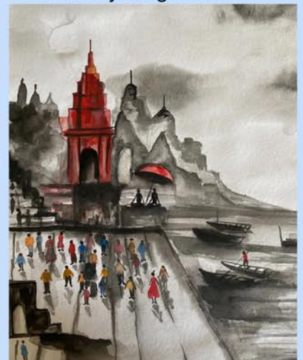
Vaibhavi Bansal- X