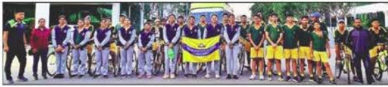
The team of SYNA who participated in the ninth edition of school's cycle expedition 'Cyclathon'.

The riding adventure was organized under the guidance of SYNA's IAYP in charge Deepak